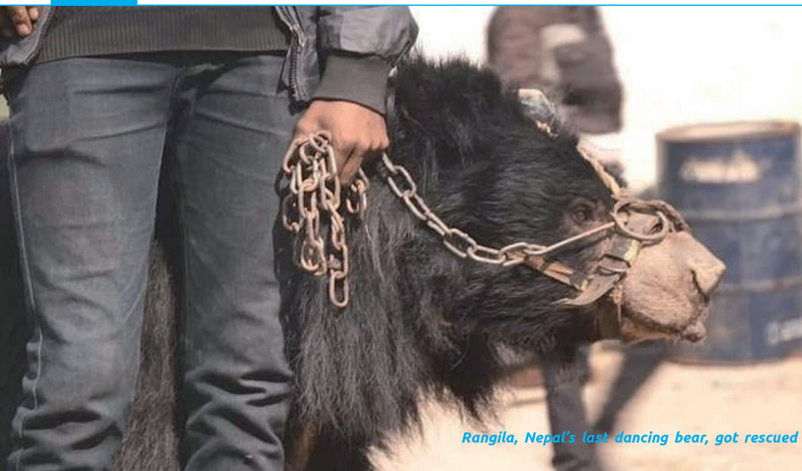
Rangila, Nepal's last dancing bear, got rescued

In October, we marked the start of Dashain (one of Nepal's largest Hindu festivals), by launching our annual campaign against the practice of Pashubali or sacrificing animals in the name of religion. We visited a number of temples across Kathmandu, putting up posters and talking to people about the need to stop animal sacrifice. In Hinduism, the practice of sacrificing animals started due to misinterpretation; Hindu scriptures such as the Gita and some Puranas in fact forbid animal sacrifice.