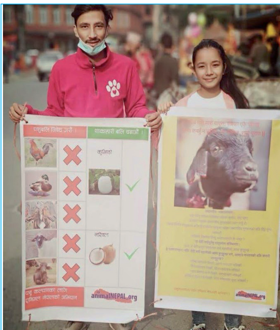
Campaigning against animal sacrifice in the heart of Patan

The full report is available on our website.