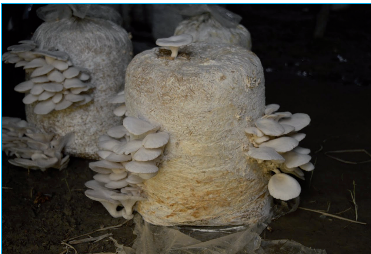
Mushrooms produced by the women of Hirminiya

In 2018, Animal Nepal's Equine Welfare Project addressed equine welfare in Hirminiya, Banke district, an area in the West of Nepal, in which the majority of the households are equine owners.