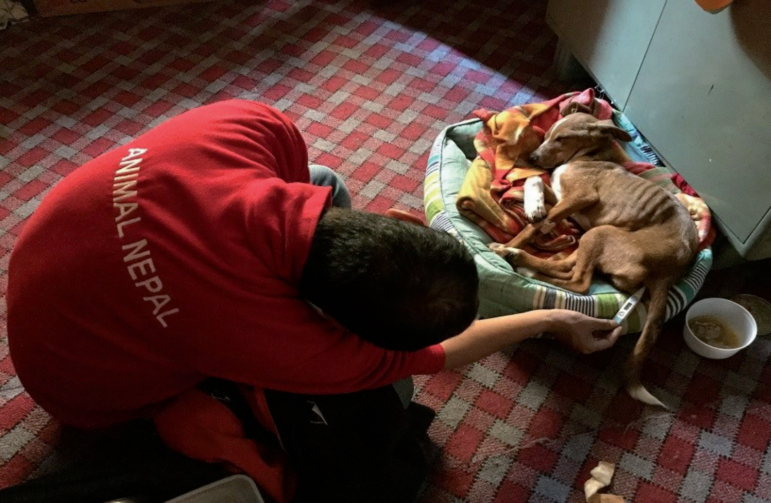
A mobile vet technician treats a sick stray dog at the home of a community member

Dogs that cannot be treated on the street are treated in Chobar and returned back to their locality once recovered . Some puppies, elderly and handicapped dogs cannot return and are given up for adoption. In 2018 we were successful in rehoming 35 dogs, seven of whom were adopted in Canada and the USA.